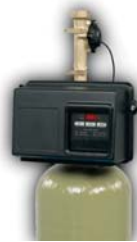
1 " Valve with meter option