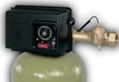
1 1/2" Valve with meter option