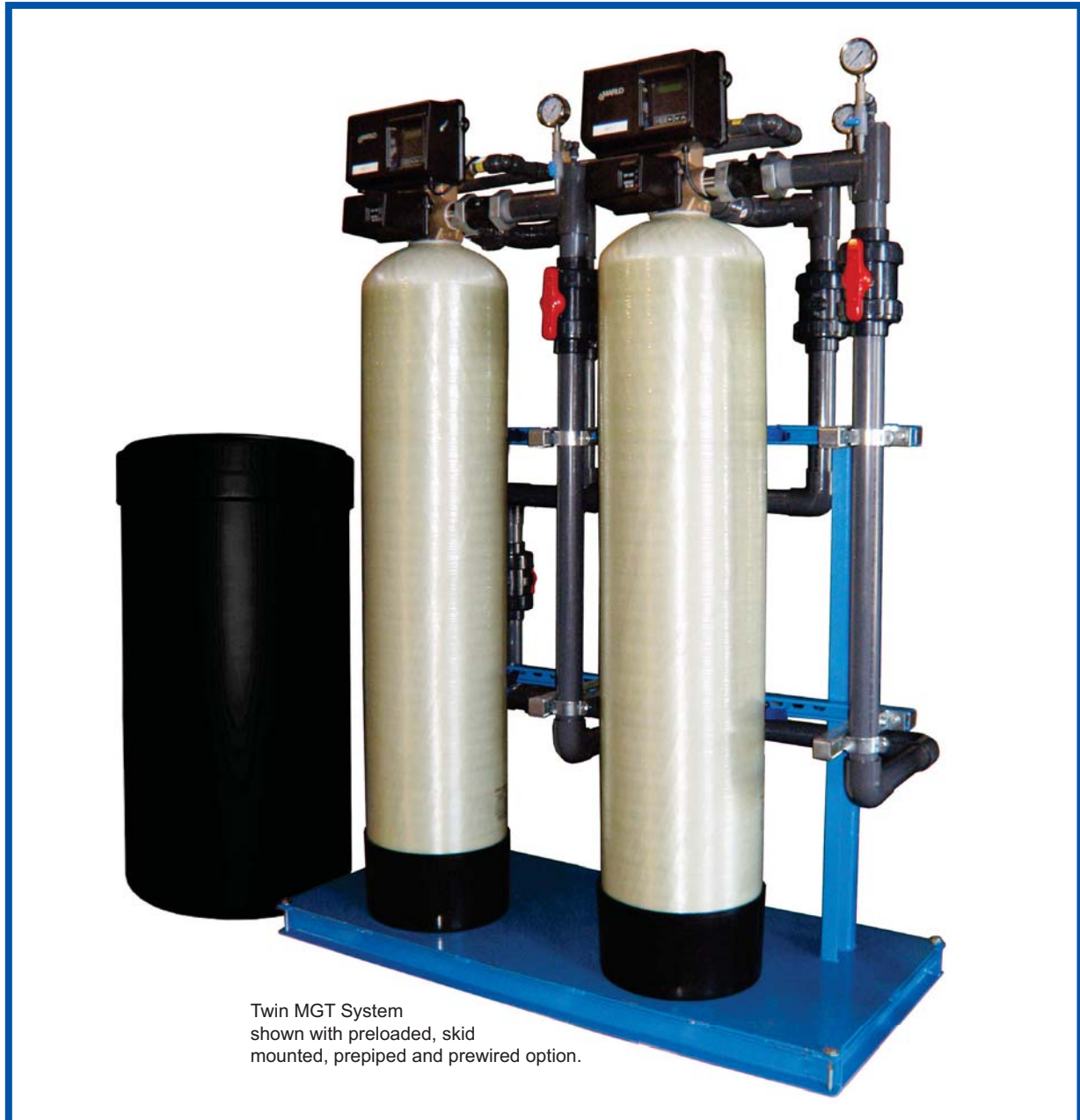
Twin MGT System shown with preloaded, skid mounted, prepiped and prewired option.