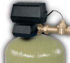
2" Valve with meter option