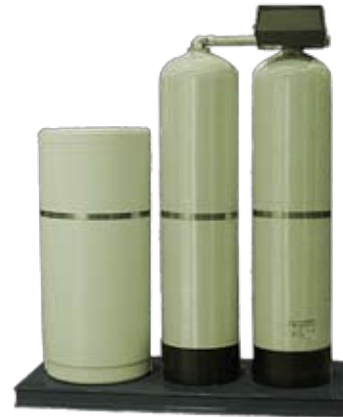
Optional: Preloaded, Skid Mounted, Prepiped and Prewired