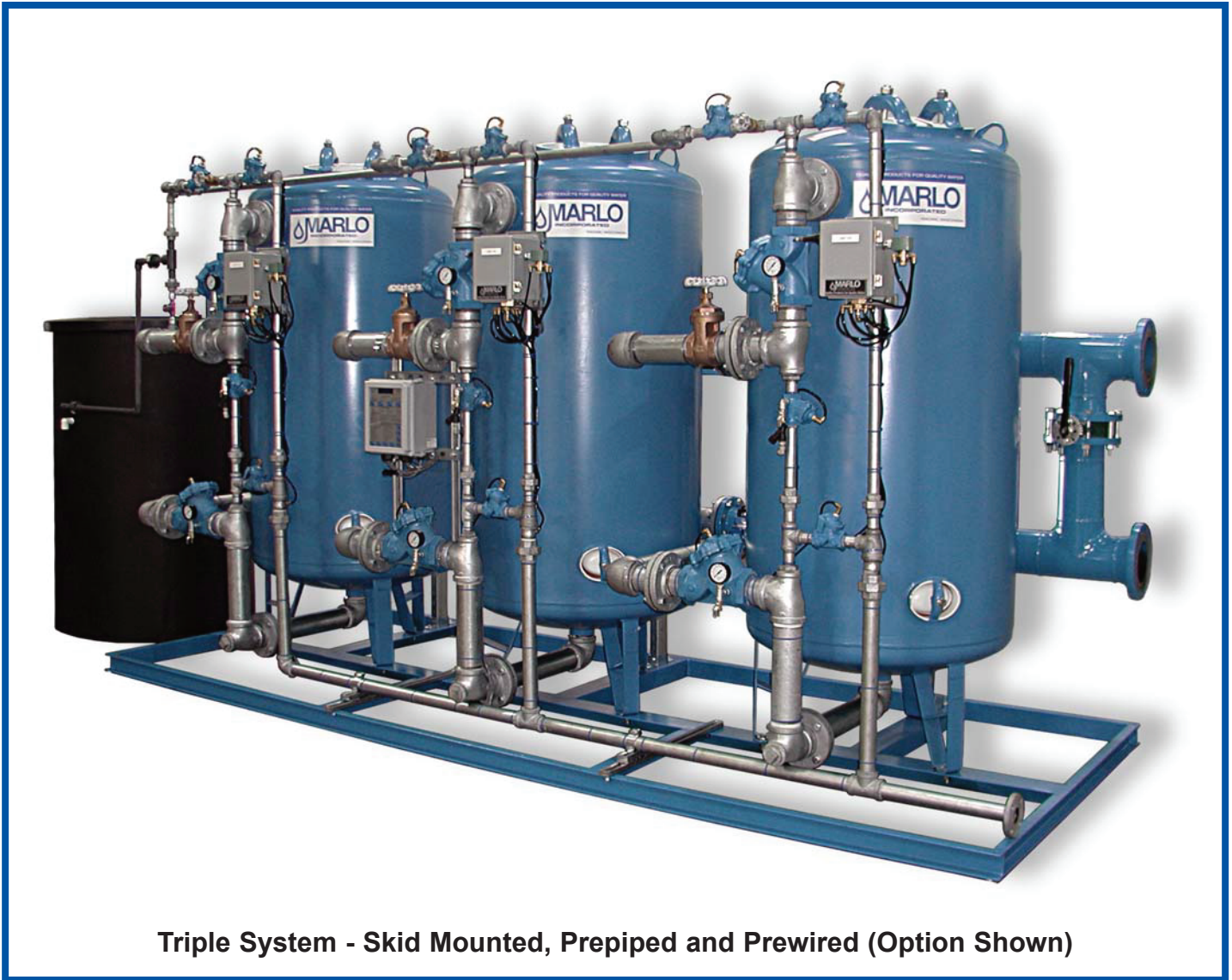
Triple System - Skid Mounted, Prepped and Prewired (Option Shown)