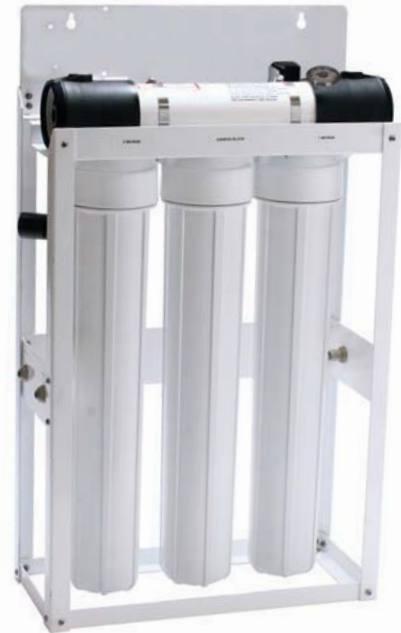
Optional Floor Standing Frame